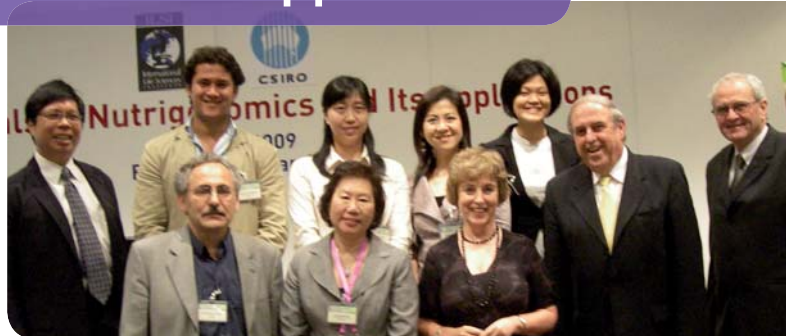
Speakers and organizers of the seminar and workshop

On October 4, 2009, ILSI SEA Region in collaboration with Australia's Commonwealth Scientific and Industrial Research Organization (CSIRO) organized a pre-congress Seminar and Workshop on Fundamentals of Nutrigenomics and Its Applications to introduce nutrigenomics, a science that examines how genetics and nutrition interaction affects human health, to health professionals and researchers new to this field. The program was well attended to its full capacity with over 60 participants from various universities, health organisations and industries worldwide.