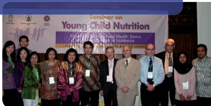
Speakers and Organizers at the Seminar on Young Child Nutrition

On November 12, 2009, ILSI SEA Region, together with Indonesian Pediatric Society (IDAI) and SEAMEO TROP MED, organized a one-day Seminar on Young Child Nutrition at Borobudur Hotel, Jakarta, Indonesia, to share the latest updates on the nutritional and health status of young children in Indonesia and discuss strategies to improve feeding practices and growth of young children. Relevant experiences and approaches from France, New Zealand and Malaysia were also shared. Over 220 participants from medical institutions, regulatory agencies, research institutions, and industries attended the seminar.