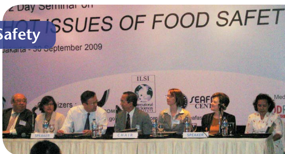
Speakers at the Seminars on Hot Issues of Food Safety

A half-day Seminar on Hot Issues of Food Safety was organized by ILSI SEA Region in collaboration with National Agency for Drug and Food Control (BPOM), Indonesia and Southeast Asian Food and Agricultural Science and Technology (SEAFST) Centre, Indonesia. Held in conjunction with the 8th AFSSH, the seminar took place on September 30, 2009, at Borobudur Hotel, Jakarta, Indonesia and was attended by over 160 participants.