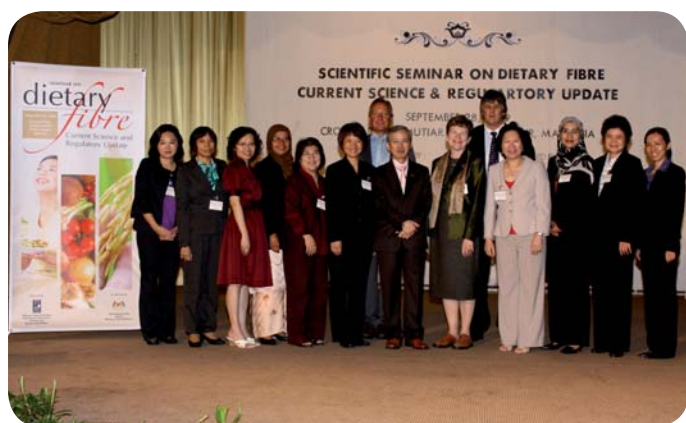
Speakers and organizers at the Seminar on Dietary Fibre

A lively question and answer session discussed on the needs to harmonize the definition of dietary fibre and the importance for the regional countries to decide on adoption of oligosaccharide based on scientific evidence and consensus. ILSI SEA Region will continue to facilitate scientific forum and harmonization efforts on this topic for the region.