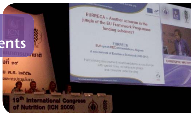
Presenters of the EURRECCA session