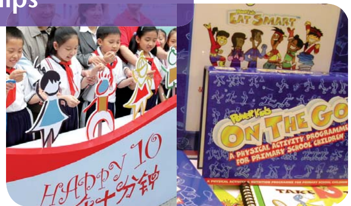
Various ILSI programs and resource materials on obesity prevention