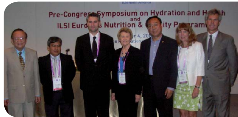
Speakers and organizers of the Symposium on Hydration and Health