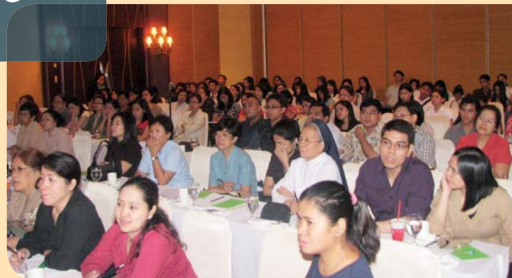
Participants at the Symposium on Nutrition and Heart Health

ILSI SEA Region's Philippines Country Committee held a Symposium on Nutrition and Heart Health on November 25, 2009, at EDSA Shangri-la Hotel, Manila, Philippines. Attended by more than 150 participants, the symposium provided a forum for discussing the nutritional and dietary aspects of cardiovascular disease (CVD) prevention and control, and the challenges and opportunities they offer to public health and food industry.