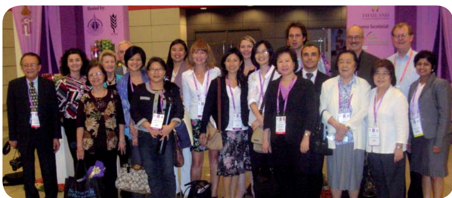
ILSI staff, scientific directors and advisors, and members from different branches come together at the 19th ICN Congress

ILSI Southeast Asia Region, ILSI North America, ILSI Europe and ILSI Research Foundation participated actively at the congress, organizing sessions on several