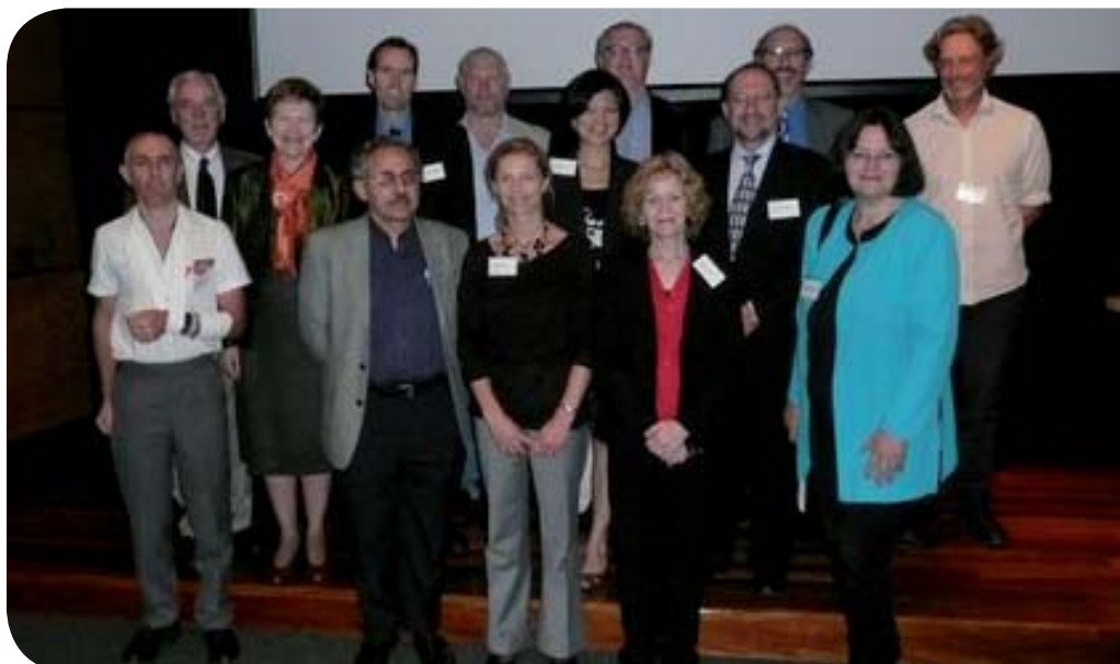
Speakers at the Seminar on Vegetables Nutrition

On November 12, 2009, ILSI SEA Region’s Australasia Country Committee organized a one-day Seminar on Vegetable Nutrition at Telstra Conference Centre, Melbourne, Australia. Attended by over 70 participants, this seminar brought together the latest findings in vegetable nutrition research and insights into vegetable consumption with consumer communication strategies to promote the benefits of vegetables in the diet.